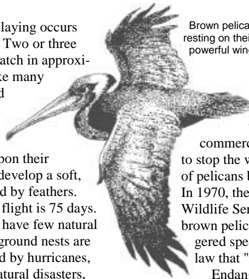
Brown pelicans fly with their heads resting on their backs, using slow powerful wingbeats.

Several efforts in the early part of the century were meant to curb the decline of brown pelicans. In 1903, President Theodore Roosevelt designated Florida's Pelican Island as the first national wildlife refuge, a move that helped reduce the threat of plume hunters. Passage of the Migratory Bird Treaty Act in 1918 gave protection to pelicans and other birds and helped curb illegal killing.