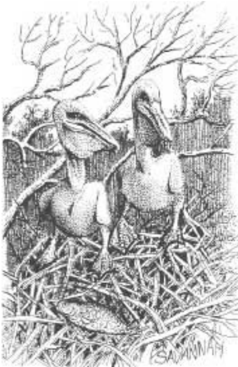
Young pelicans are blind, featherless, and altricial , meaning they are completely dependent upon their parents.

built up 4 to 10 inches above ground, or it may be a large mound of soil and debris with a cavity in the top. A tree-top nest is built of reeds, grass, and straw heaped on a mound of sticks interwoven with the supporting tree branches. In most of the pelican's U.S. nesting range (South Carolina to Florida in the East; Southern California in the West; and Alabama, Louisiana, And Texas on