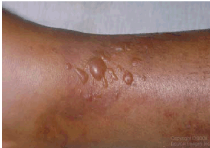
FIGURE 3. Primary septicemic skin lesions caused by Vibrio vulnificus