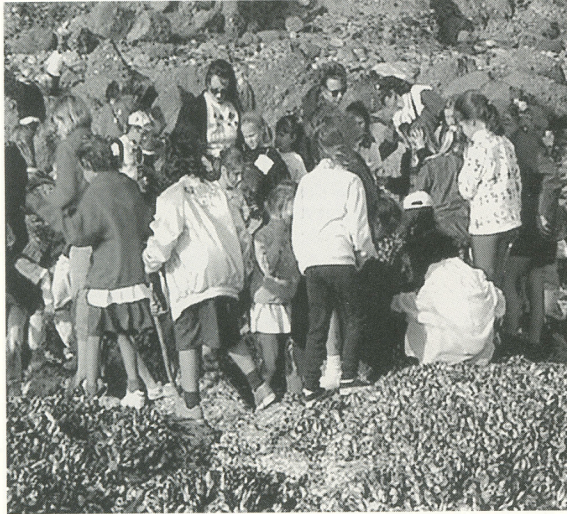
Figure 2. A large group of young people walks on organisms while participating in an educational field trip in the Dana Point MLR.

variety of rocky intertidal species (Keough and Quinn 1991, 1998; Brosnan and Crumrine 1994; Addressi 1995; Brown and Taylor 1999). Southern California intertidal populations susceptible to trampling include fleshy seaweeds, coralline algae, fragile tube-forming polychaetes, bivalves such as mussels, acorn barnacles, limpets, and grapsid crabs that seek refuge under loose rocks and seaweeds during low tide (Ghazanshahi et al. 1983; Murray 1998). Upper-shore fleshy seaweeds have been shown to be particularly susceptible to damage from human foot traffic throughout the world (Boalch et al. 1974; Beauchamp and Gowing 1982; Povey and Keough 1991; Brosnan and Crumrine 1994; Keough and Quinn 1998; Murray 1998; Schiel and Taylor 1999).