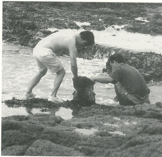
Figure 4. Collectors fill a bag with mussels in the Laguna Beach MLR.

Most collectors seemed to remove organisms for food or fish bait, although sometimes we found people tak-